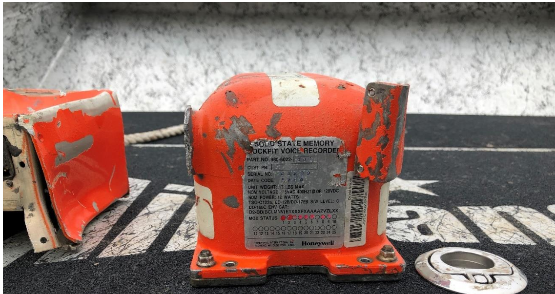
Figure 1. The CVR as recovered from Trinity Bay, Baytown, Texas.

Upon arrival to the laboratory, the CVR's CSMU was rinsed in reverse osmosis filtered fresh water. The recorder was removed from the water and the CSMU was disassembled on a laboratory work bench. The CSMU did not appear to have any heat damage and the memory board was retrieved from inside the unit (figure 2).