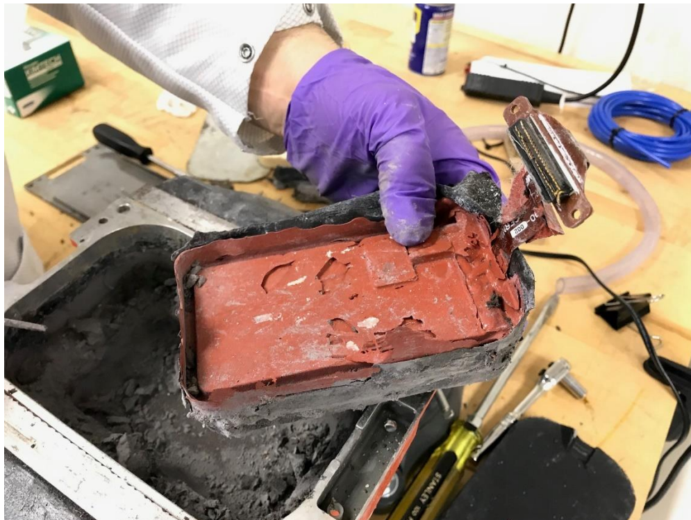
Figure 2. The internal memory board being removed from the CSMU.

Upon arrival to the laboratory, the CVR's CSMU was rinsed in reverse osmosis filtered fresh water. The recorder was removed from the water and the CSMU was disassembled on a laboratory work bench. The CSMU did not appear to have any heat damage and the memory board was retrieved from inside the unit (figure 2).